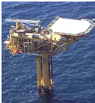
Wandoo A Monopod