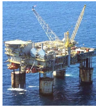
Wandoo B Facility

The produced oil is exported by tanker via a floating hose from a CALM Buoy. The CALM Buoy is moored by 6 anchor chains and is supplied by two flexible flowlines from the Wandoo B storage compartments.