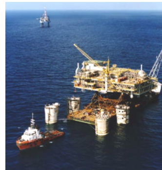
Wandoo B Topsides Floatover Installation

Reuse of the facilities was also considered.