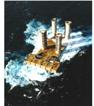
Wandoo B CGS