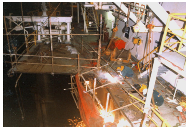
After the damaged platform was removed repair work was done on the main girder.

ICON personnel boarded the rig while it was under tow and made preparations for the work such that the new steelwork could be brought on board and installed whilst the rig was still in protected coastal waters.