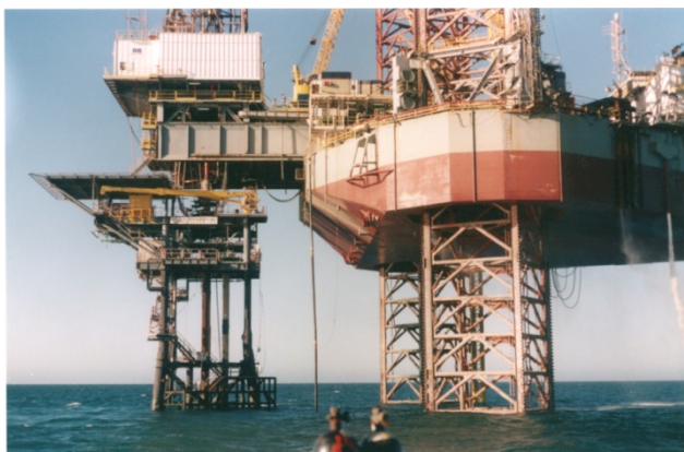
View of the Ron Tappmeyer at Saladin A

ICON provided a turnkey service covering conceptual and detailed design, fabrication, preparation of installation procedures and supervision of offshore installation. ICON personnel were trained to carry out supervisory roles normally undertaken by operators under the Wapet Permit to Work System.