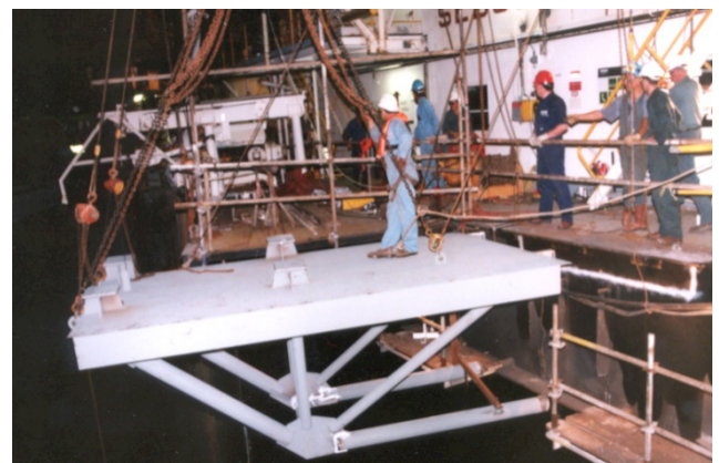
Lifting the new deck section into place

The work was completed without any delay to the rig's tow progress and the rig was ready to commence work on arrival in New Zealand.