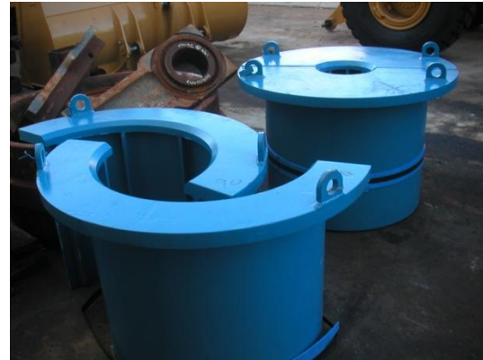
Push type Conductor Tensioner Insert Bushes

ICON Insert Bushes are designed to support all standard size drilling conductors from 13 3/8" to a maximum size of 30" in conjunction with the ICON T-series Push Type Conductor Tensioner Systems and also tensioners from other manufacturers.