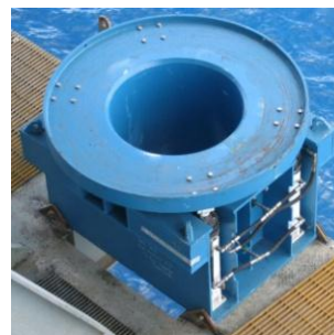
Above: Above Deck Installation