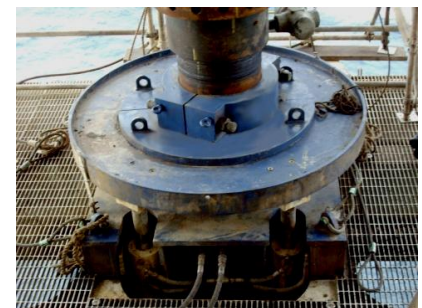
Typical Conductor Gripper Clamp Installation