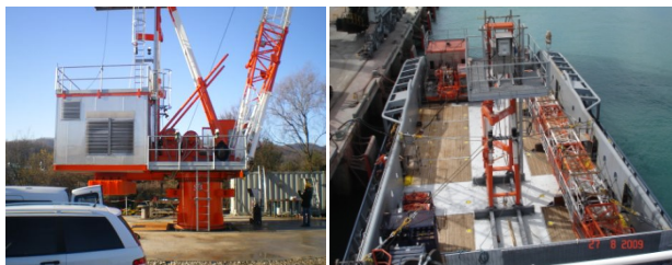
Trial assembly shore side / Sea fastening for voyage

The Platform Crane installation was to be conducted using the Diamond Offshore "Ocean Shield" MODU. Due to the high loads of the new crane unit and the MODU's lifting capacity at radius, ICON had to develop a piece-small installation strategy. To ensure this ran without a hitch, a trial assembly of the crane was conducted onshore in Darwin.