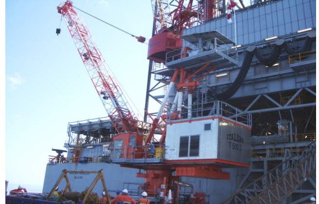
Blacktip crane installed and tested