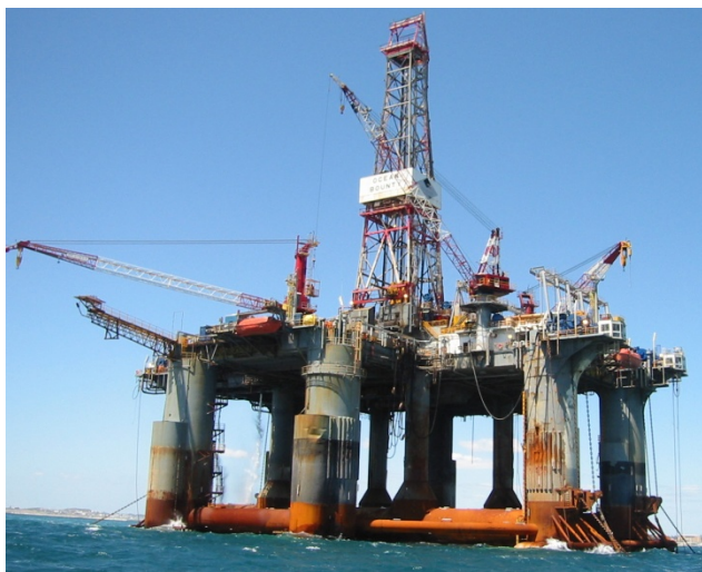
Ocean Bounty Mobile Offshore Drilling Unit (MODU)

ICON was contracted by Diamond Offshore to upgrade the Ocean Bounty MODU to improve the rig's tree handling capabilities. ICON carried out the project on a turnkey basis to ABS rules. The scope included a major re-configuration of the cellar deck area, repositioning of two deck cranes, installation of a new deck crane and provision of a subsea tree skidding system. The work was undertaken while the rig was under tow from a drilling location in Bass Strait in the SE corner of Australia to a location on the Northwest Shelf Western Australia. Careful planning avoided an expensive shipyard visit.