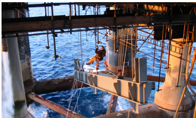
Installation of 12m long x 1.2m deep girder while on tow

The port side cellar deck was lowered approximately 2m. This involved re-configuration of the primary support steel of the cellar deck and relocation of numerous rig piping systems and services. Detailed forward planning and comprehensive installation procedures ensured the work could be carried out safely on-tow with no access to onshore fabrication services. ICON provided a dedicated engineering and construction team to integrate with the rig crew to coordinate and execute the work.