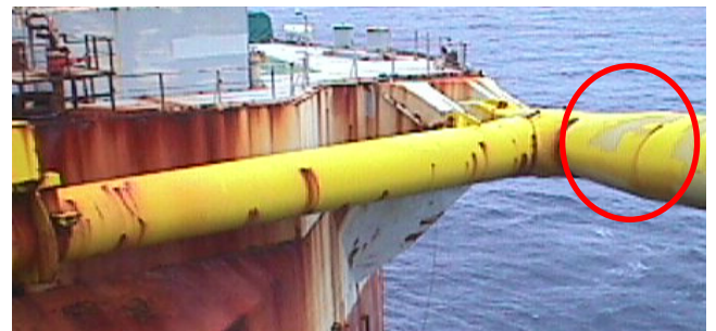
Possible Yoke cutting location

Our naval architecture group also analysed the SALM in a free floating condition under tow to a scrapping location.