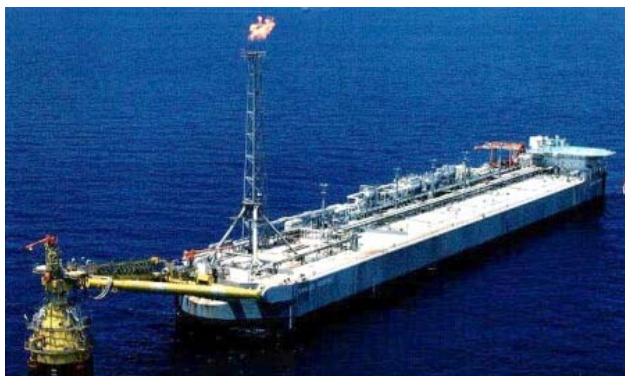
Challis Venture FPSO Connected to RTM