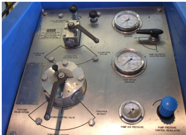
Operators Control Panel