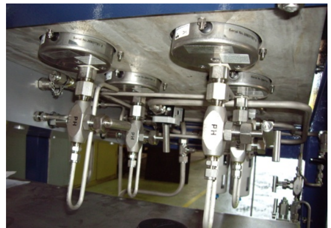
Corrosion resistant alloy products throughout