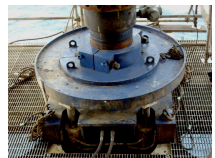
Typical Conductor Gripper Clamp Installation